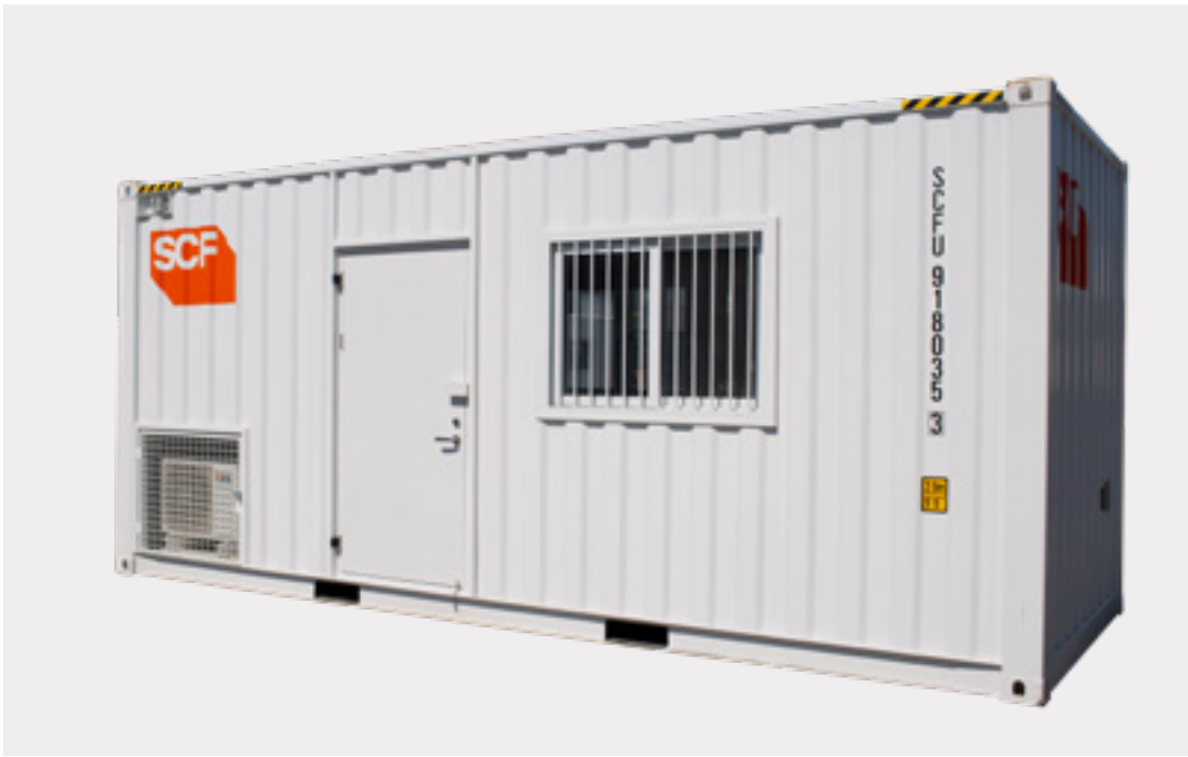
Top: SCF's Crib Room can be stacked for increased flexibility on space constrained sites.