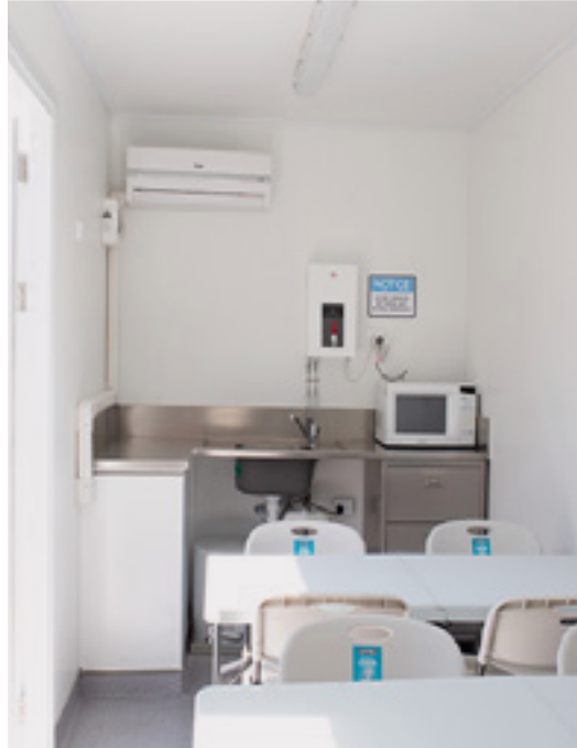
Middle Right: Various configurations available based on your needs.